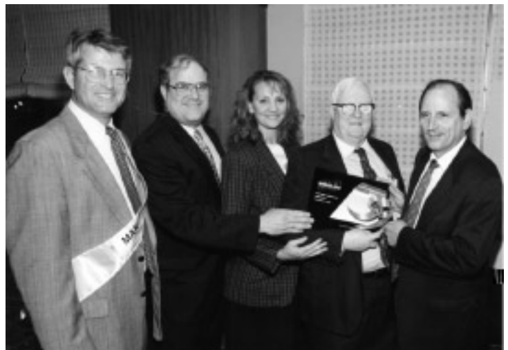
Chicago Lighthouse Industries' marketing and manufacturing team accepts Manufacturer That Counts Award from the Chicago Manufacturing Center.

The clocks evolved from a brainstorming session in 1975 when a group of Lighthouse employees sat down to determine a product that could be made by people who were blind or visually impaired. During the session, it was suggested that clocks would be worth investigating, and it proved to be the right choice.